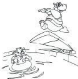
swimming where someone is diving