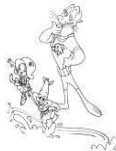
swimming with an adult